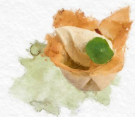
Halls Family Dairy Camembert