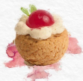
Banister Downs Dairy Cream