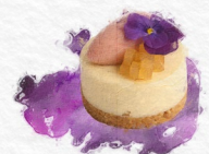
Tucker Bush Quandong