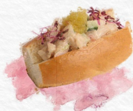
Northern Star Seafood Shark Bay prawns