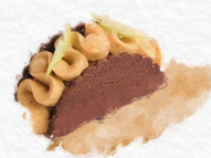
Morley Growers Market Pears